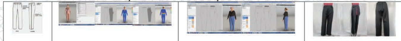
Trousers with double slider zippers on the side seams