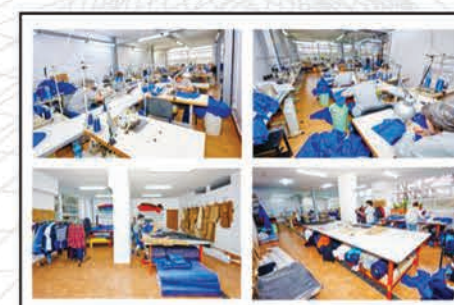
Insights from incubated company SC Xtreme Equipament SRL

ITA TEXCONF is part of the National Network for Innovation and Technology Transfer ReNITT and acts for the sustainable economic and social development of the textile sector, by ensuring access to technological performance, developing the innovative environment, introducing quality systems and developing human resources.