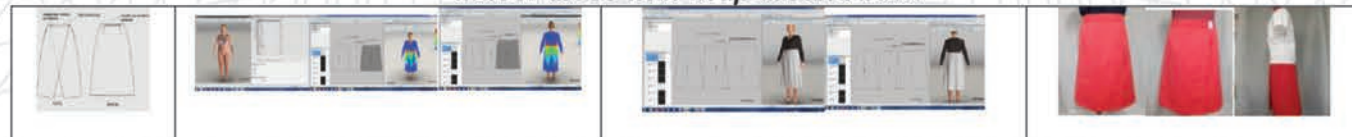
Wrap skirt with Velcro straps on the waistband